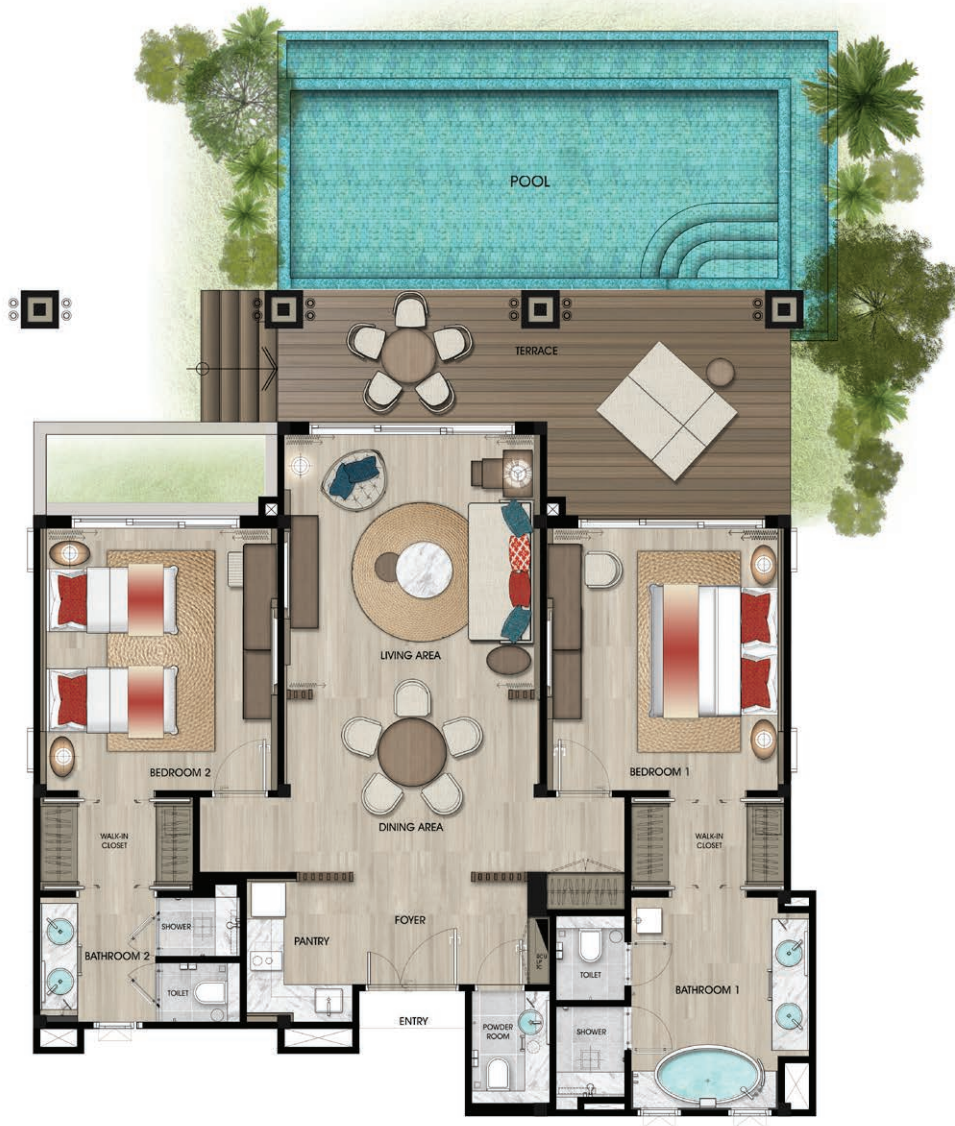
2 BEDROOM POOL SUITE (172.66 Sq.m.)

Featuring a rustic tropical design that compliments the natural private vistas landscape, this luxurious 2 Bedroom Suite of 135.44 sq.m. (upper floor) opens up to a spacious living area and balcon. Large floor to ceiling windows in all rooms opens up to the natural breezes so that you can enjoy your perfect holiday. The luxurious 2 Bedroom Pool Suite of 172.66 sq.m. (lower floor) enjoys the same open design as the upper floor while seamlessly blending the spacious living area with the outer deck and large private pool taking full advantage of the beautiful ocean.