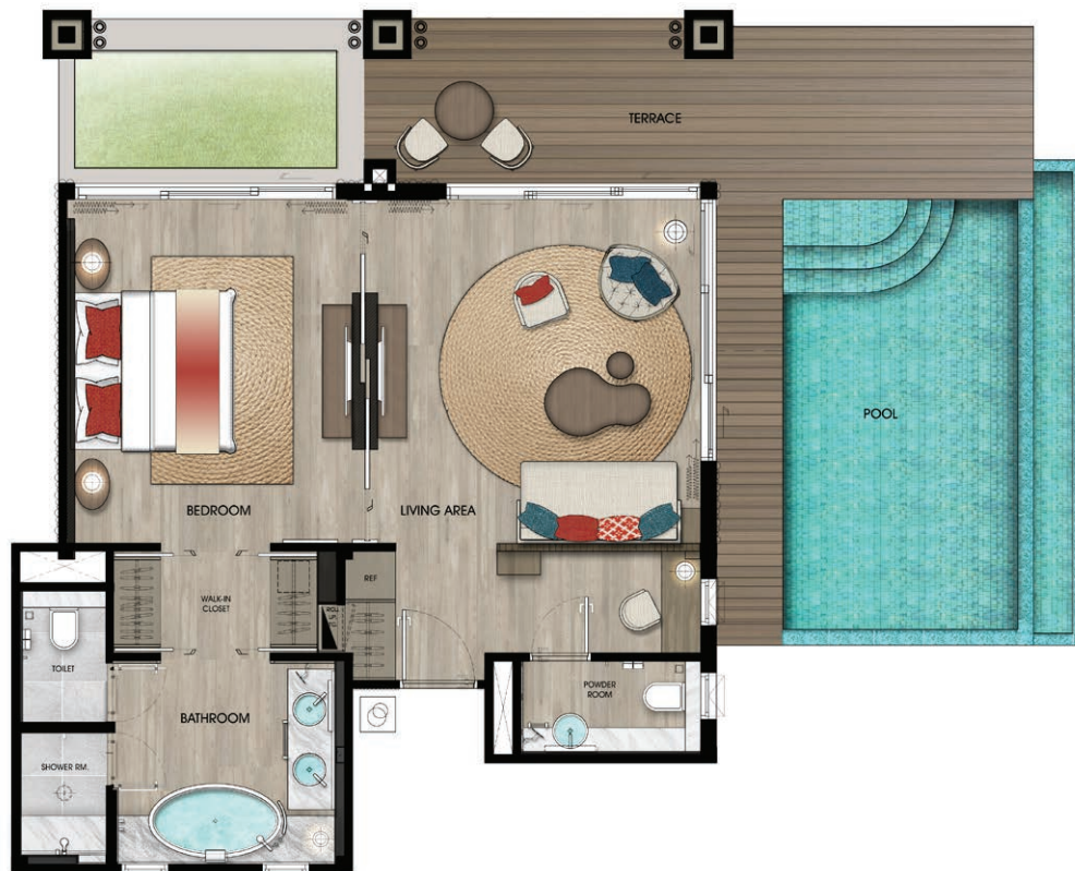
1 BEDROOM POOLSUITE (117.82 Sq.m.)

The rustic tropical design gracefully blends with the surrounding waterfalls and lagoons to create your own private oasis. This luxurious One-Bedroom Suite of 83.75 sq.m. (upper floor) features a large bedroom and living area with private balcony overlooking the beautiful tropical landscape for your exclusive getaway. The luxurious One-Bedroom Pool Suite of 117.82 sq.m. (lower floor) features the same open design as the upper floor with spacious living area, private pool and terrace flowing into one grand lofty area for your complete relaxation.