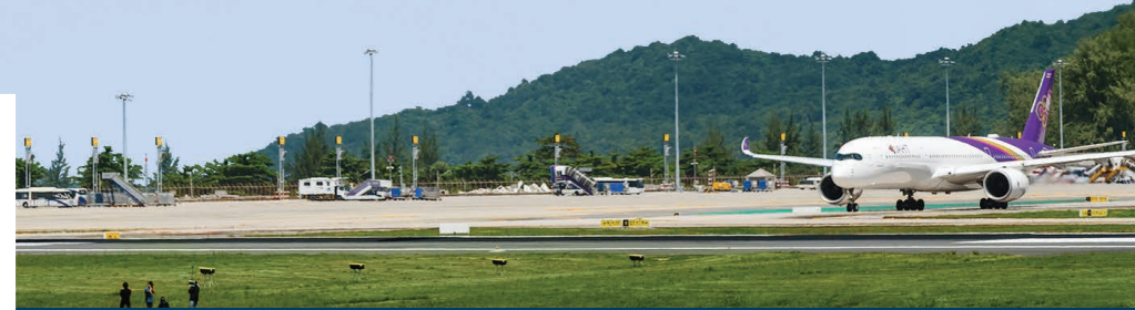
KRABI INTERNATIONAL AIRPORT