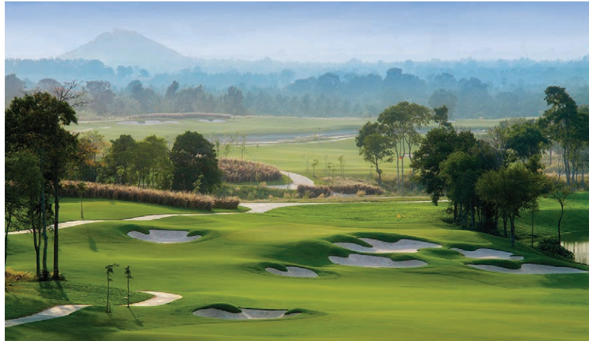
PAKASAI COUNTRY CLUB