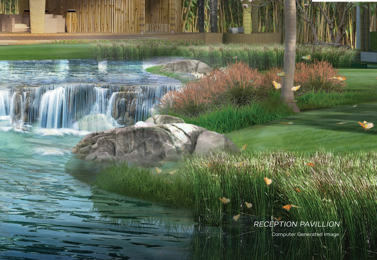
RECEPTION PAVILLION Computer Generated Image