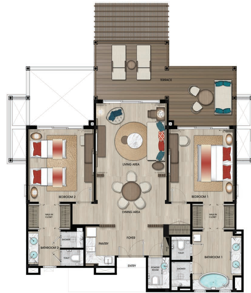
2 BEDROOM SUITE (135.44 Sq.m.)