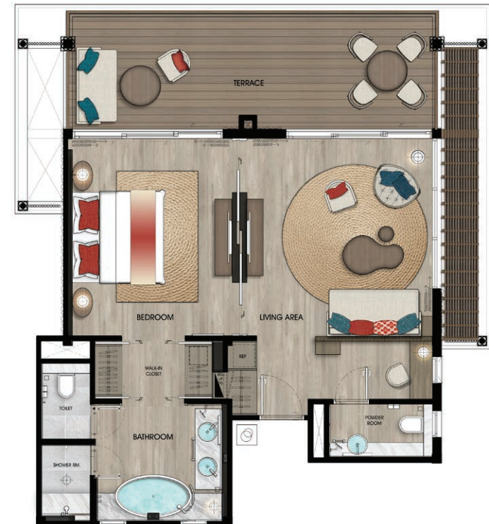
1 BEDROOM SUITE (83.75 Sq.m.)