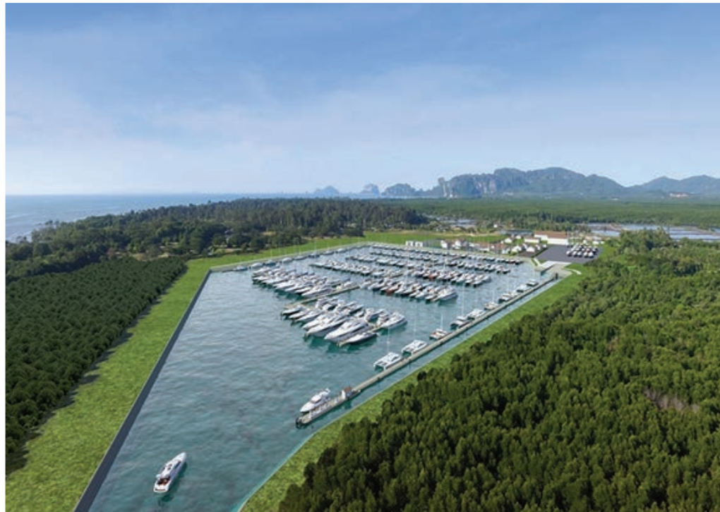
PORT TAKOLA YACHT MARINA & BOATYARD KRABI

Port Takola Yacht Marina & Boatyard Krabi and Krabi Boat Lagoon Marina and golf courses are just a short drive away. Many amazing natural attractions and famous cultural landmarks are found nearby, making this location easily accessible yet private and peaceful.